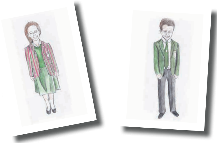
By Zoe Campbell

This is how you should look when you come to school: